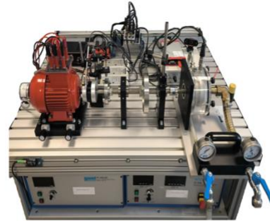
1. Hardware solution for machine monitoring

Throughout the project, you will gain hands-on experience in data processing, HMI development in a workflow that efficiently transforms raw data into actionable insights. You will showcase your work through a demo highlighting your HMI's key features and benefits. By completing this project, you will gain a general overview of PHM and develop skills in data analysis, AI and cloud IoT service development, and user interface design, preparing you for a successful career in the fast-growing and talent-scarce field of equipment life-cycle management.