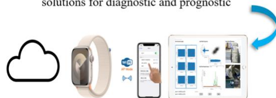
3. Cloud and IoT solutions for predictive maintenance