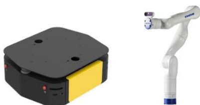
Fig. 2: Two available robots: The Mobile robot (left) and the collaborative one (right)